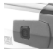
Auto IRIS Lens

1/4" Sharp Super Color CCD Normal resolution 420TVL 0.8 Lux