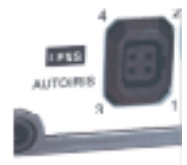
Auto IRIS Lens